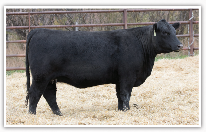
Full Sister: J Square S Ruth 37H

142J is another outstanding Alcatraz son. Alcatraz has proven to be a very consistent breeder here as well as across the country. The daughters in production look to have a very promising future as well. 142J's dam is one of our leading cows in terms of production and has also been a successful donor as well.