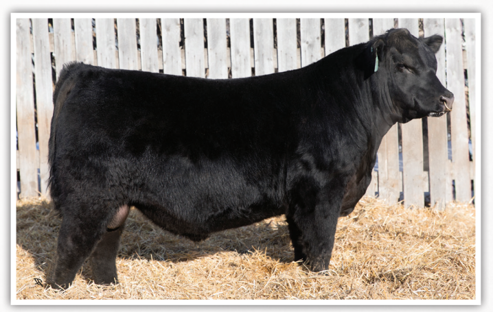
Sire: J Square S Prarie Gold 989G