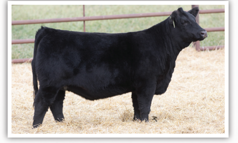
Full Sister: J Square S Forever Lady 109J