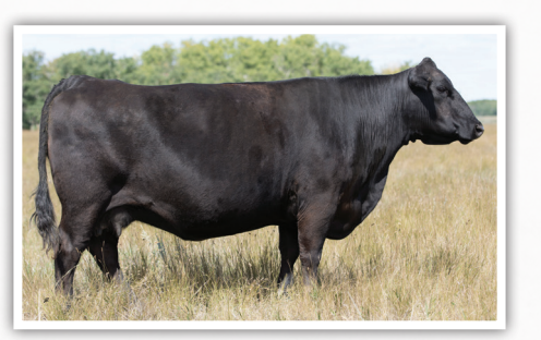
Dam:Northern View Ruth 82Z

142J is another outstanding Alcatraz son. Alcatraz has proven to be a very consistent breeder here as well as across the country. The daughters in production look to have a very promising future as well. 142J's dam is one of our leading cows in terms of production and has also been a successful donor as well.