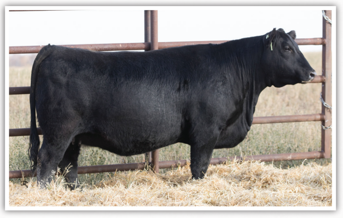
Maternal Sister: AT Tibbie 1G