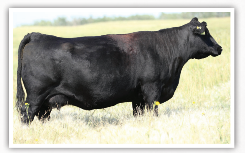
Dam:Triple J & S Forever Lady 301Y